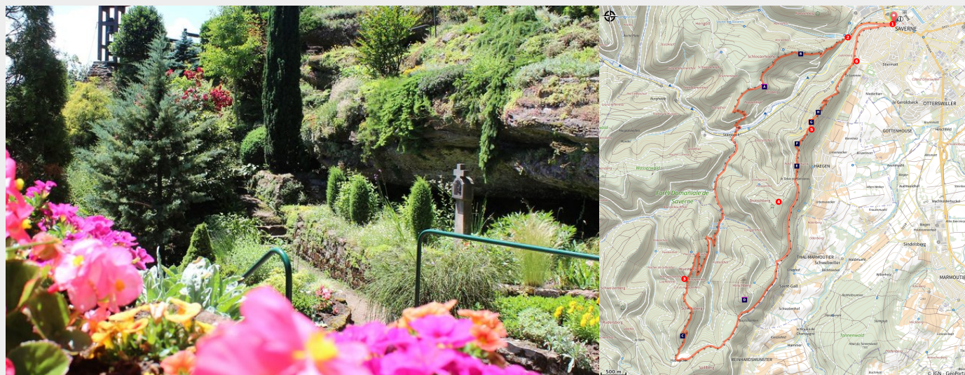
Jardin alpestre de la Grotte Saint Vit