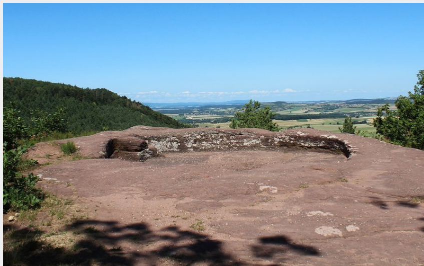
(OT Pays de Saverne)