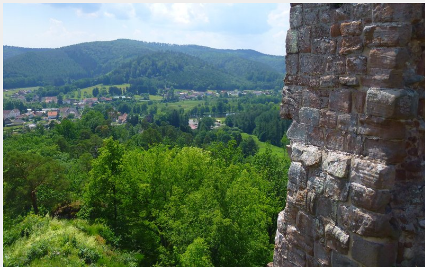
Château du Ramstein (PNRVN - A.Serylo)