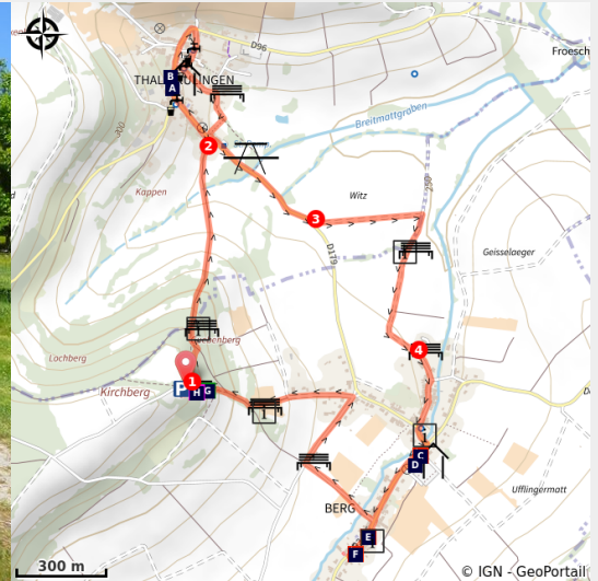
Un raccourci vers la chapelle du Kirchberg

A country walk between Hill and Valley to discover the history of two villages once gathered in Kirchberg.