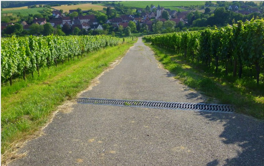
Descente vers Cleebourg (PNRVN - A. Serylo)