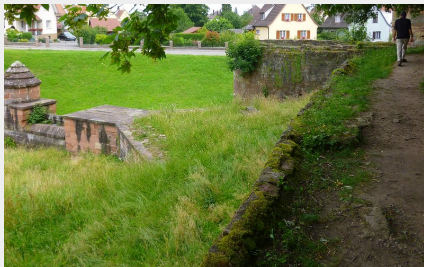
Vers la tour de la Poudrière.