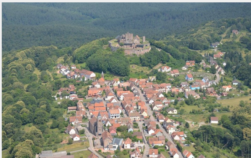
Commune de Lichtenberg et sa forteresse