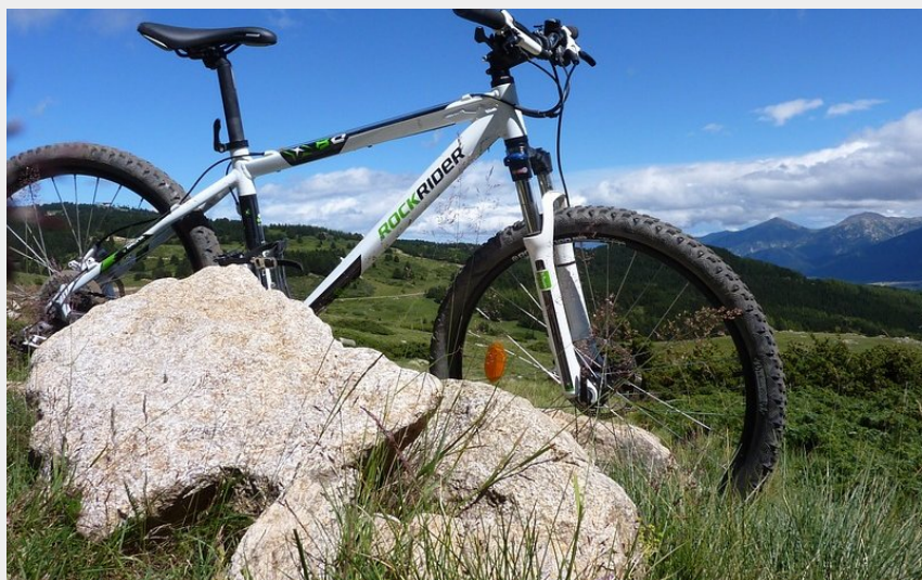
Ferme du Gimbelhof