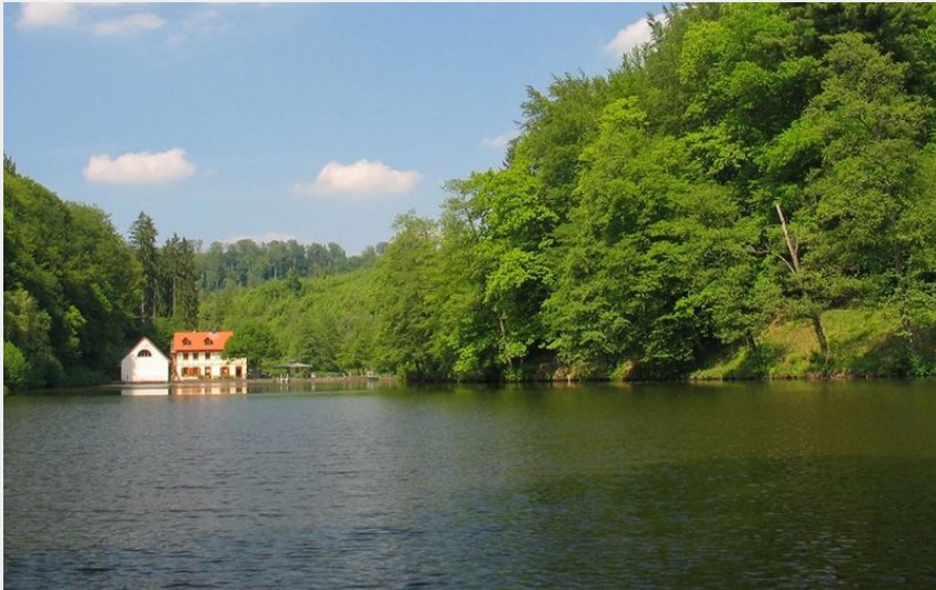
Étang du Donnenbach