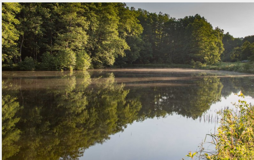
Les étangs du Kohlthal (A.Dorschner)