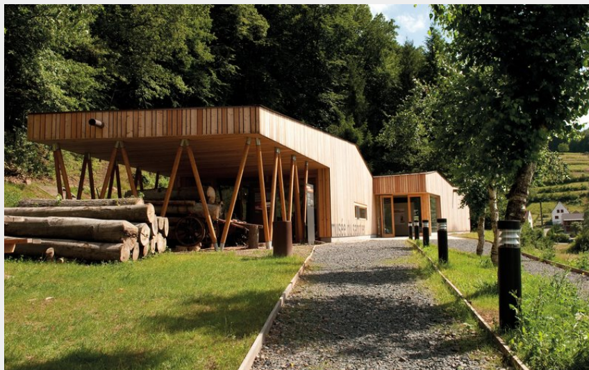
Musée du sabot (PNRVN)