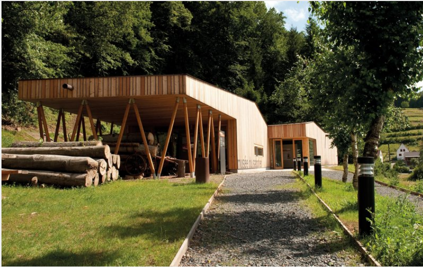
Musée du sabot (PNRVN)