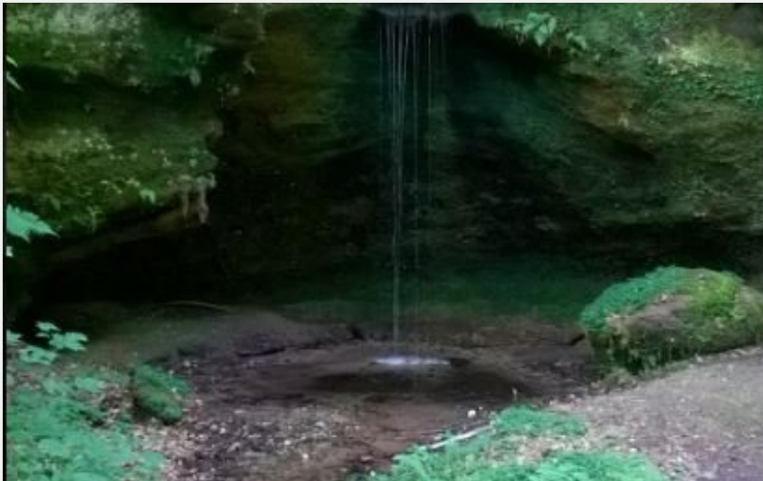
Cascade de la Neubach à Schorbach