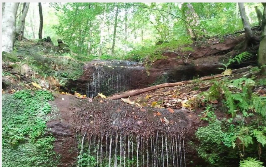
Cascade des Ondines à Lemberg