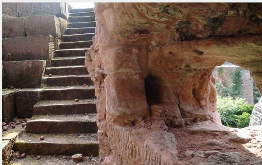
Château du Weckersburg à Walschbronn