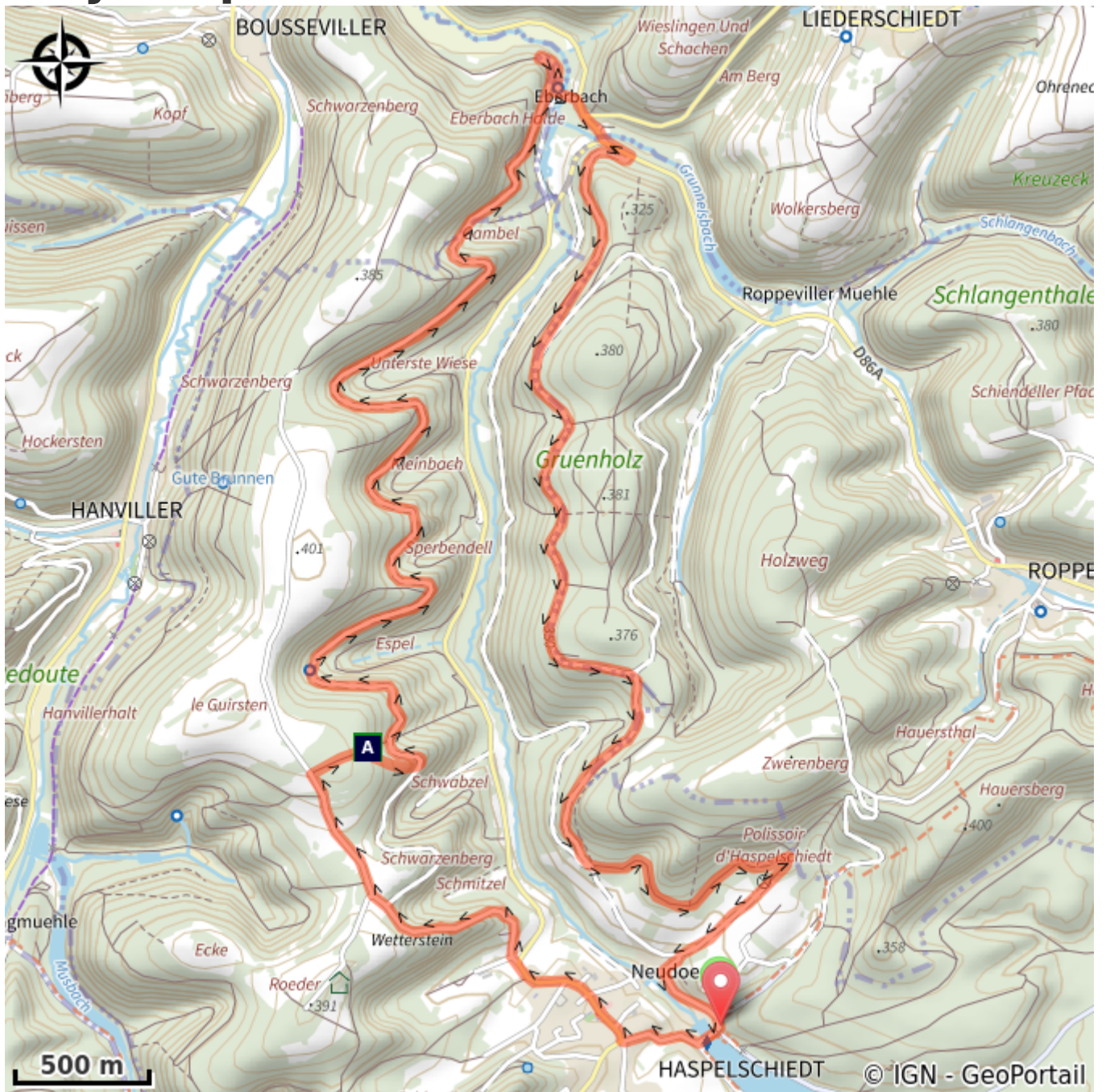
🌳 Kaiser's Oak (A)