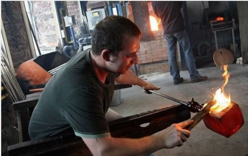
Savoir-faire des verriers de Meisenthal