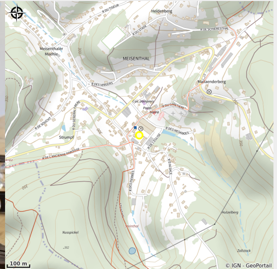
Attribution : Musée du Verre (M.Chérot)