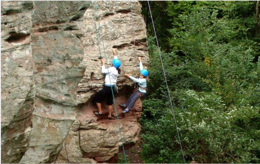
Attribution : Rocher de Langenfels (SYCOPARC)